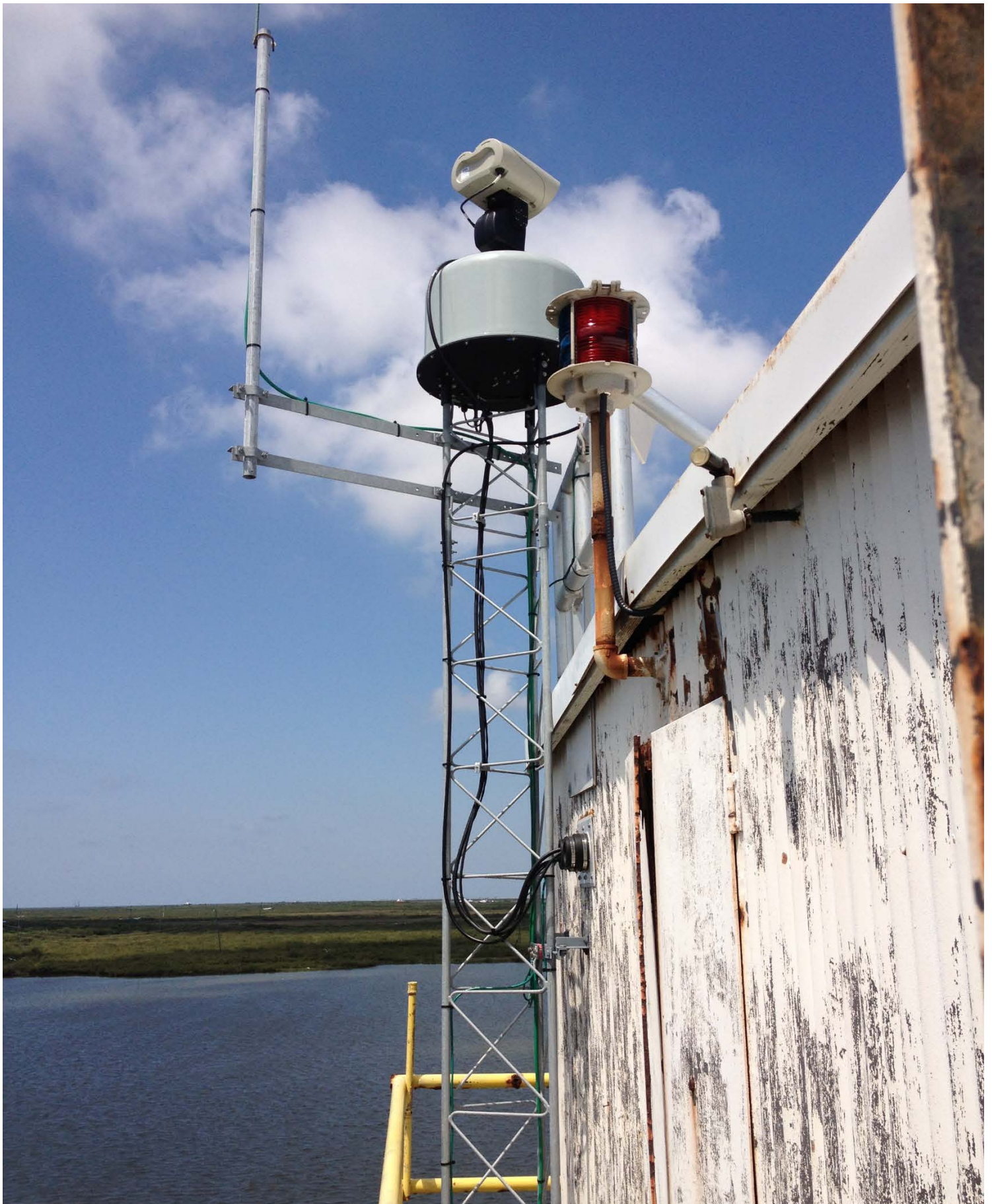
Figure 2. IDAR and thermal camera protecting waters in Louisiana

Sales Information about this product: sales@dmtradar.com , +1-703-291-1524